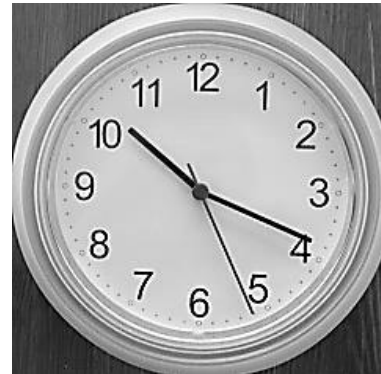
Time Right Now

b. The clock to the right show Paul's departure time. Estimate the time to the nearest 10 minutes.